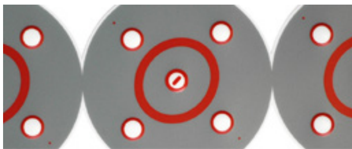
Fig.: Printed film

UV lacquers can be applied to print clear window lacquers on the decorative surface. This results in windows with exceptionally high transparency, clearness and a smooth coating surface – ensuring good legibility of LED and other displays. Screen-printing inks have very high brilliance, and the edge definition of printed lines and symbols is very good. Moreover, although not necessary, post-curing of the film increases its resistance to chemicals, if required.