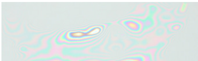
Figure: Newton's rings

Newton's rings, visible in the form of light and dark concentric circles, can occasionally be seen on displays and touch screens and are undesirable. They can greatly impair image recognition and create an unattractive optical effect.