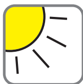
Figure: With UV protection

There are different solutions for avoiding this interference, e.g. the printing of minute spacers, optical bonding to the display, and our product with an Anti-Newton layer. The latter solution saves an additional work step, reduces production times and makes the frequently annoying, visible spacers unnecessary.