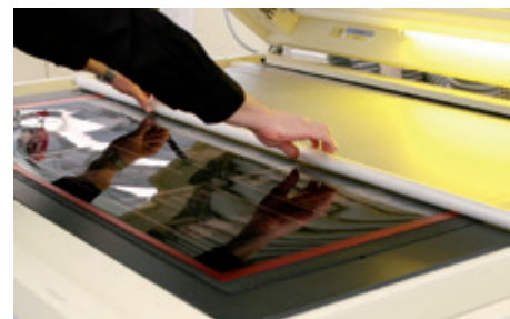
Precise reproduction to printing plate