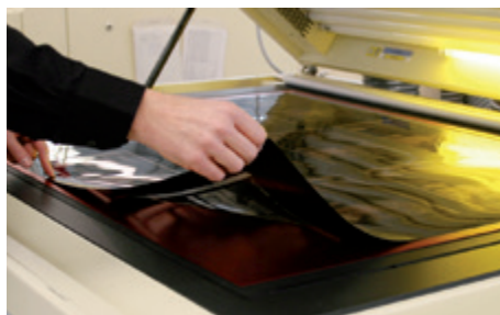
The LADF can be used without prior cleaning