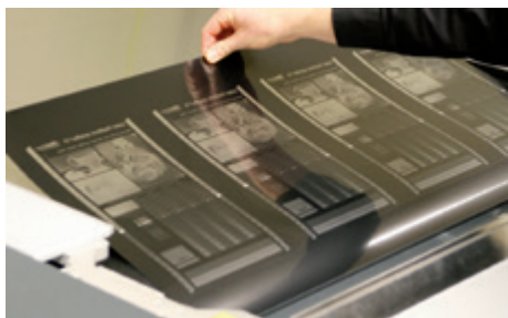
Imaging with IR-laser